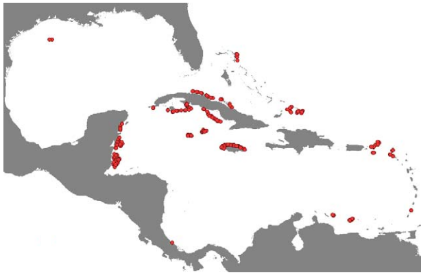
Figure 1. Map of the Caribbean indicating the locations sampled. Filled circles, sampled sites.