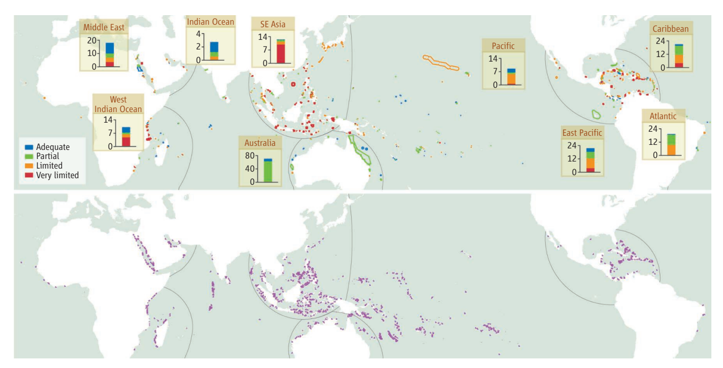
Conservation of MPAs. ( Top ) Status of the global network. Location and shape of all 980 MPAs are shown. Categorization of MPAs was based on the average of the attributes analyzed ( 9 ). The percent of coral reefs per region covered by MPAs in those categories is shown on the bar charts. ( Bottom ) MPAs needed for an optimum coverage of the world's coral reefs. Dots represent MPAs of 10 km² and spaced at 15 km from each other.

which are often the targets of fishermen, these can cover several square kilometers (6, 7, 13). About 40% of the areas in the current global network of coral reef MPAs are smaller than 1 to 2 km² (fig. S2B). This suggests that in a large portion of the network, vagile, and usually also key, species can be lost directly to harvesting because they can move beyond the boundaries of small MPAs. Such losses can also trigger negative indirect effects on resilience of coral reefs through trophic cascades (1).