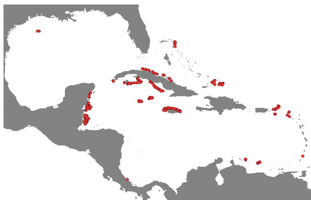
Figure 1. Map of the Caribbean indicating the locations sampled. Filled circles, sampled sites.

methodology to sample the status of different coral reef guilds all throughout the Caribbean ( www.agraa.org ). In this paper, we used the surveys carried out in the shortest interval of consecutive years that had the largest number of locations sampled to avoid temporal variations in the guilds while increasing sampling size. In the light of this condition, our analysis has to be interpreted as a snapshot of the potential drivers of coral reef change. The surveys used were those carried out between 1999 and 2001. Those surveys were located in 322 reef sites belonging to 13 countries of the Caribbean (figure 1). The sampling comprises the broad variety of sites that may be found in the region like coastal, island and oceanic reefs with varying degrees of human densities and exposure to environmental factors. Such a sampling is likely to maximize statistical variation, and therefore provides a good proxy to assess the general causes of coral reef change in the Caribbean. We only used data from the sites located in the forereef to have a standard comparison among sites. We also included species richness in the analyses to assess potential variations in community structure along gradients of coral reef diversity. For each coral reef community, we quantified the biomass of carnivorous and herbivorous fishes, coral mortality and the abundance of macroalgae and Diadema antillarum (see extended details in the electronic supplementary material).